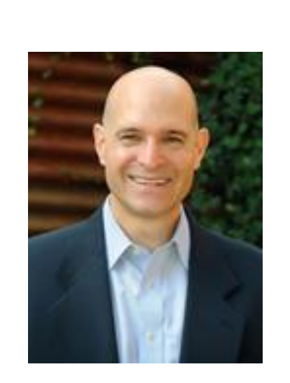
REIAC Southwest Disruptive Technology In Construction November 7, 2018 Paradise Valley Country Club

Wednseday, November 7, 2018 – 4:00pm – 6:30pm